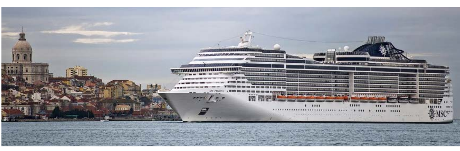
Book Your MSC Cruise for Summer 2018 and Benefit from Last Minute Smart Deals!